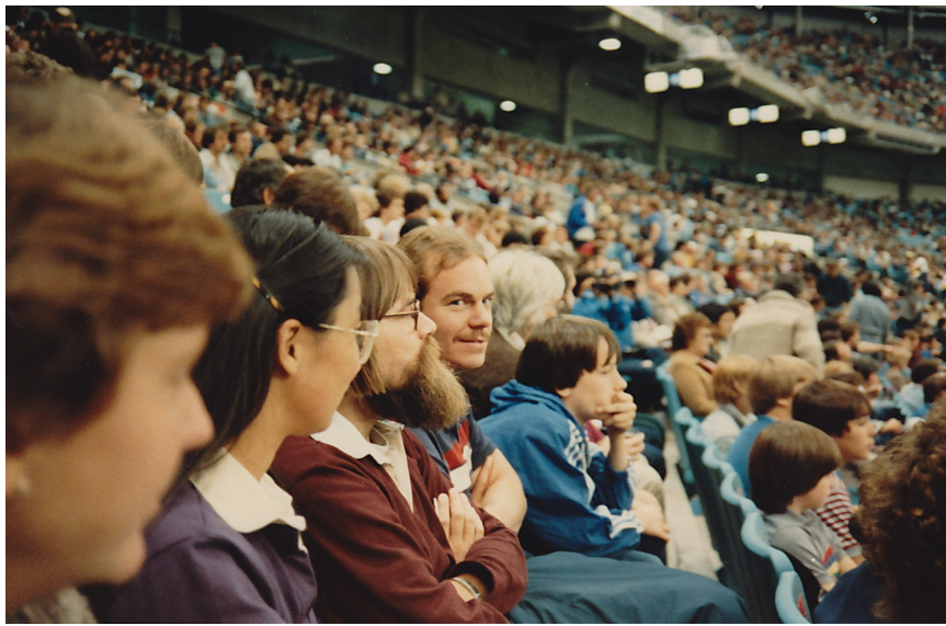
Seattle Sounders at the Kingdome